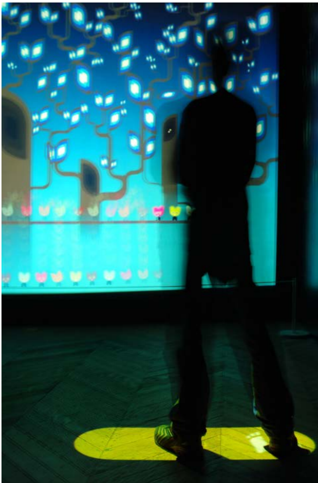
INSYDE BY AIRSIDE AT LAWALKER GALLERY, LIVERPOOL, 2007