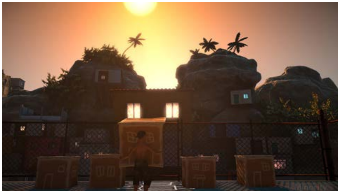
✓ PAPO Y YO © MINORITY