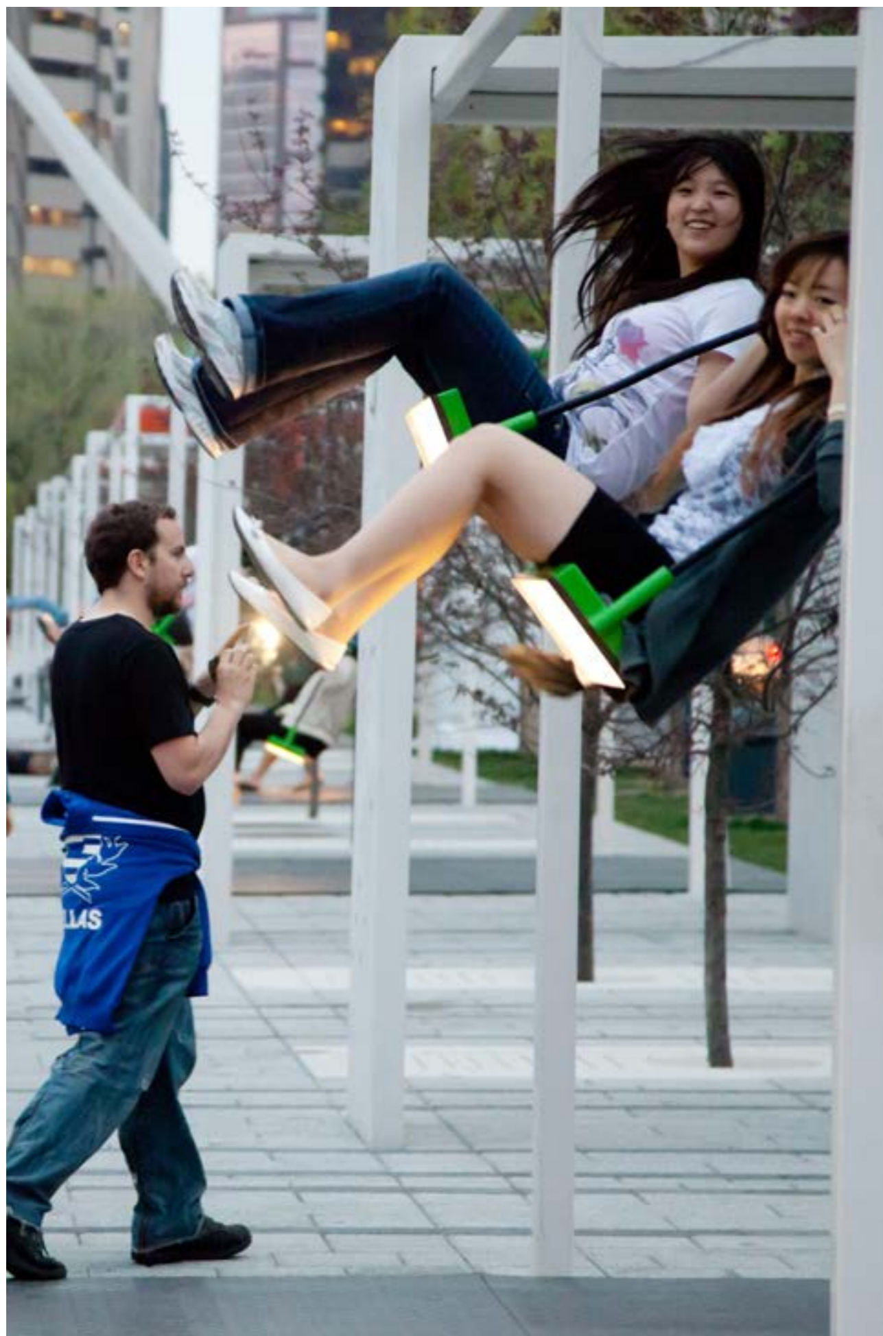
DAILY TOUS LES JOURS' BALANÇOIRES © OLIVIER BLOUIN