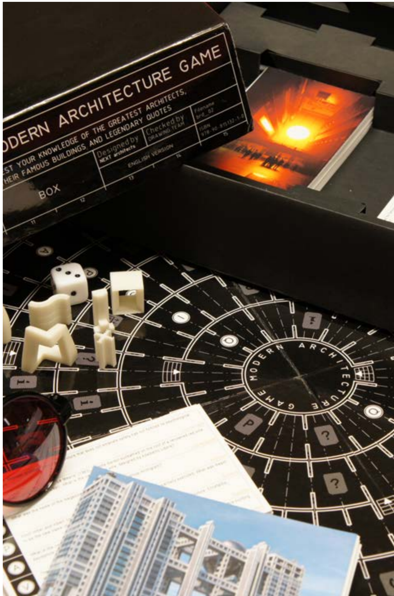
THE MODERN ARCHITECTURE GAME © DR